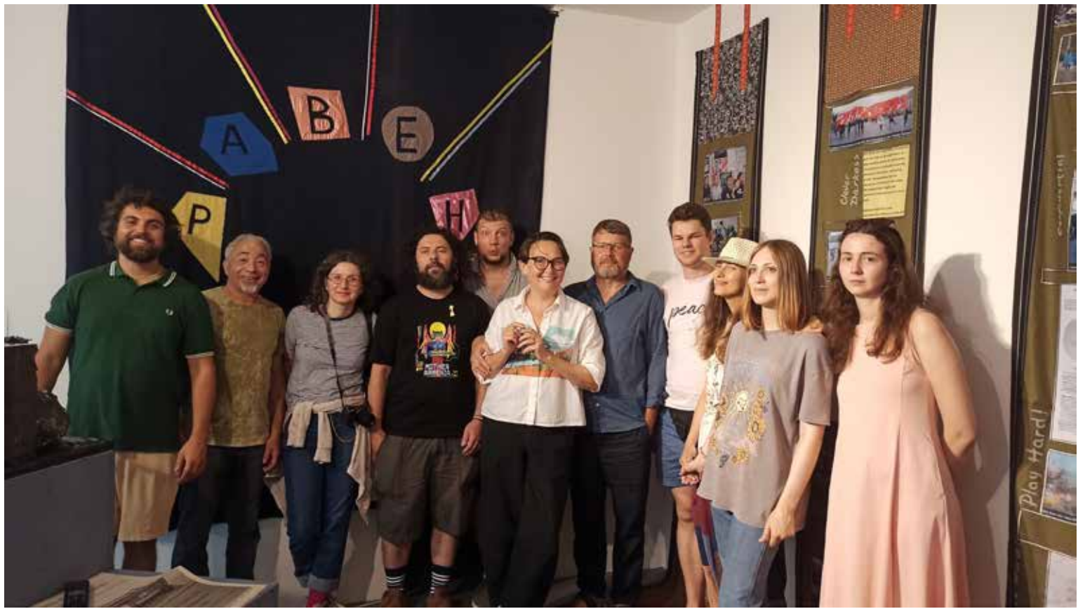
Visitors to the guided tour with many participants of Rosa's House of Culture, august 2024